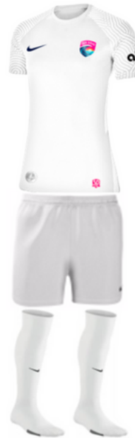
JERSEY: White SHORTS: White SOCKS: White