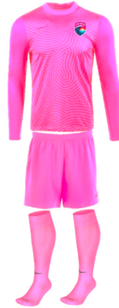
JERSEY: Pink SHORTS: Pink SOCKS: Pink