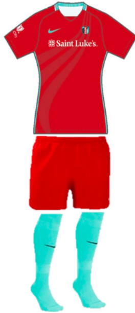
JERSEY: Red SHORTS: Red SOCKS: Teal