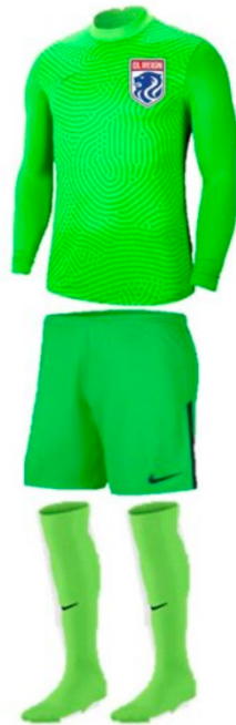
JERSEY: Green SHORTS: Green SOCKS: Green