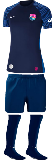
JERSEY: Navy Blue SHORTS: Navy Blue SOCKS: Navy Blue