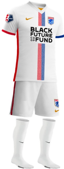
JERSEY: White SHORTS: White SOCKS: White